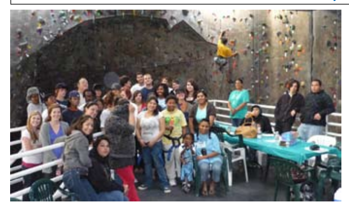
Proudly serving the San Diego American Indian Community for 15 years